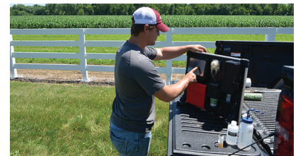
Mixing Water and Soil