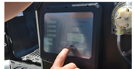
Results in Minutes